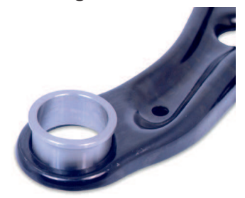
Fit shell in from radius side